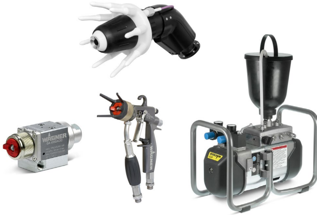
Exemplary picture of trade fair exhibits in liquid coating (feeding and application equipment)